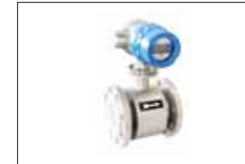
B- Compact Type