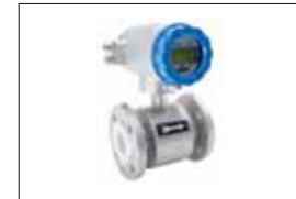
Y- Compact Type