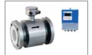
L- Remote Type